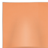
25 x 25 cm